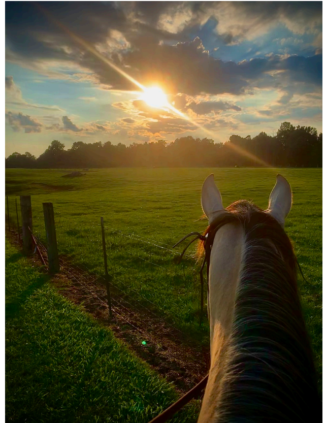
UK Student Division Farm Landscape winning photo by Noel Kubat