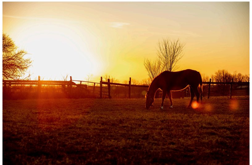
Youth Division Farm Landscape winning photo by Grace Grider