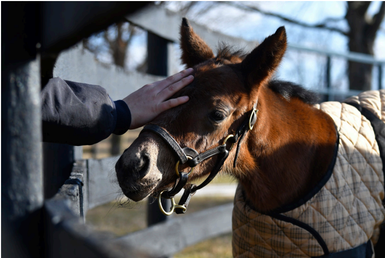
Open Division Horses and People winning