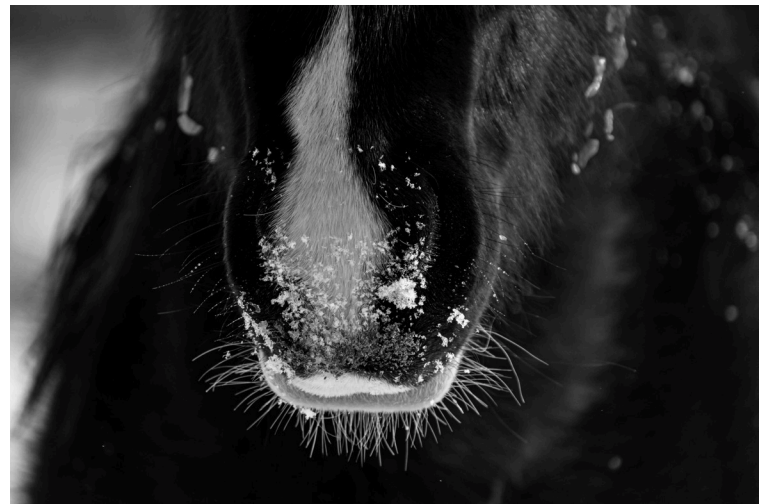
Youth Division Artistic winning photo by Audrey Cowan