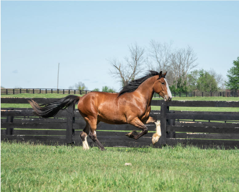
Youth Division Horses Only winning photo by Sophia Schindler