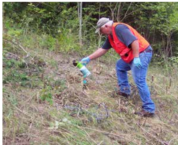
Treat bush honeysuckle plant stems with herbicide and colorant.