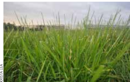
Property owners often test pastures to evaluate ergovaline levels.

In their study, the UK researchers subjected tall fescue samples to a variety of transportation and storage conditions to simulate actual situations horse owners and managers might face. Transportation conditions included in a cooler on ice or under ultraviolet (UV) lights