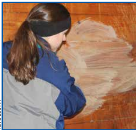
THE HORSE STAFF

Of course, there are always those "mystery microbes" in the environment that cause respiratory disease, diarrhea, limb swelling, and other conditions that veterinarians recognize as being caused by infectious agents, but are unable to find the specific cause. They can't find the exact cause usually due to limitations in current diagnostic tests. New bacteria and viruses are being found regularly with the advent of new microscopes and culturing methods. In 10 years, the list in the table will be increased—which is good since the more we know about the "bad guys," the more we can do to fight them and protect the health of horses.