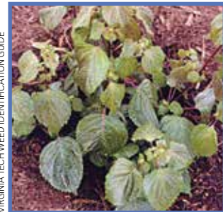
VIRGINIA TECH WEED IDENTIFICATION GUIDE