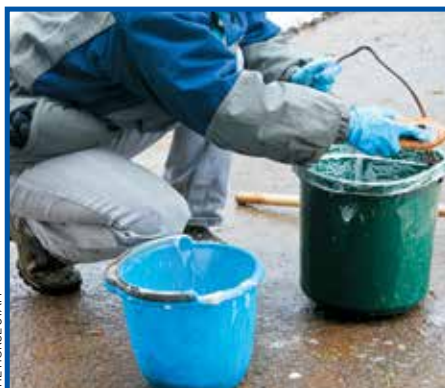
THE HORSE STAFF

So, by identifying the horse’s bacteriologic and virologic enemies and knowing that vaccination is useful, but not 100%