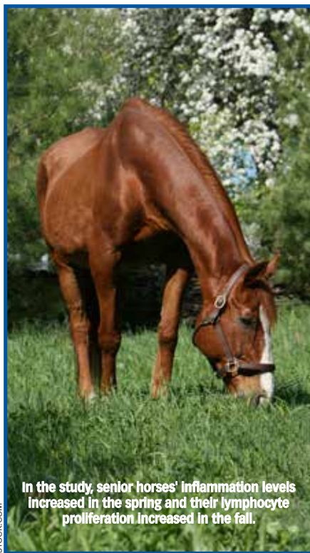
In the study, senior horses' inflammation levels increased in the spring and their lymphocyte proliferation increased in the fall.