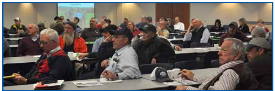
The 100+ crowd at the Alfalfa Conference included producers and growers, county agents, NRCS agents, and more.