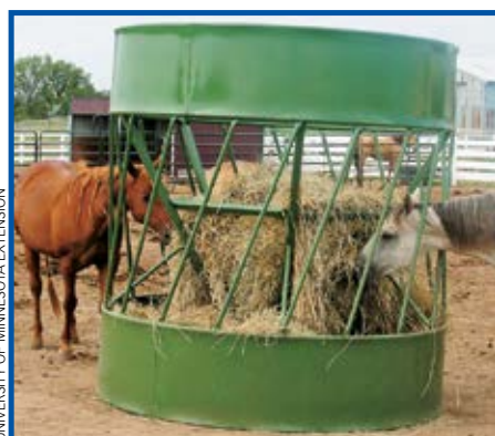
A suitable hay feeder is money well-spent.

Hay is a staple of most equines' diets. But generally, owners pay for more hay than their horses actually consume. As a result, most owners can realize savings