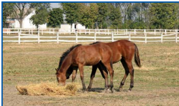
Weanlings had similar digestive capacities as mature horses.

The research team paired six weanling colts with six mature geldings (with an average age of 13.2 years) and allowed them to adapt for 21 days to a diet