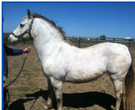
"Roanie" and "Biscuit" are two of UK's PPID and EMS research horses, respectively.