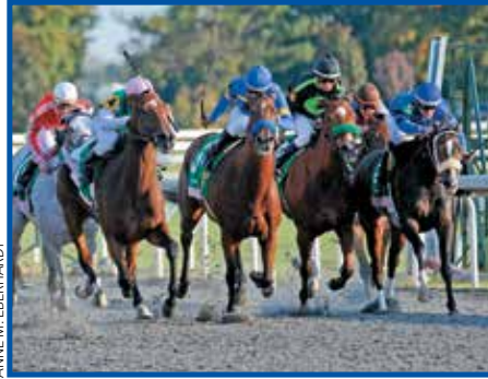
Study results show no difference in racing career longevity between horses with or without EIPH.

Using an endoscope, veterinarians grade EIPH incidents on a five-point scale, with Grade