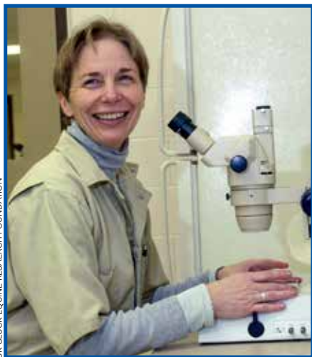
UK GLUCK EQUINE RESEARCH FOUNDATION