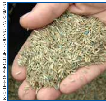
Using high-quality seed is essential for a successful overseeding application

Controlling competition from weeds is an important first step in overseeding. While herbicides are an effective way to control weeds, spraying can also hinder