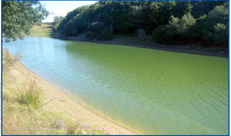
Rapid algae growth can result in a "bloom" on the surface of the water.

"Environmental factors such as water temperature, sunlight, water pH, and nutrient concentration all affect when toxins will be produced," Arnold said. "Cyanotoxins can affect the liver and nervous system and have been implicated in illness and human and livestock death in at least 35 states and in more than 50 countries worldwide."