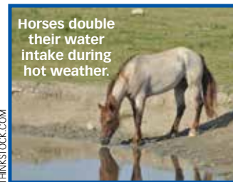
Horses double their water intake during hot weather.

The Livestock Heat Stress Index helps producers know when heat stress could create a problem for their animals. Periods of heat stress call for livestock producers to be vigilant in mak-