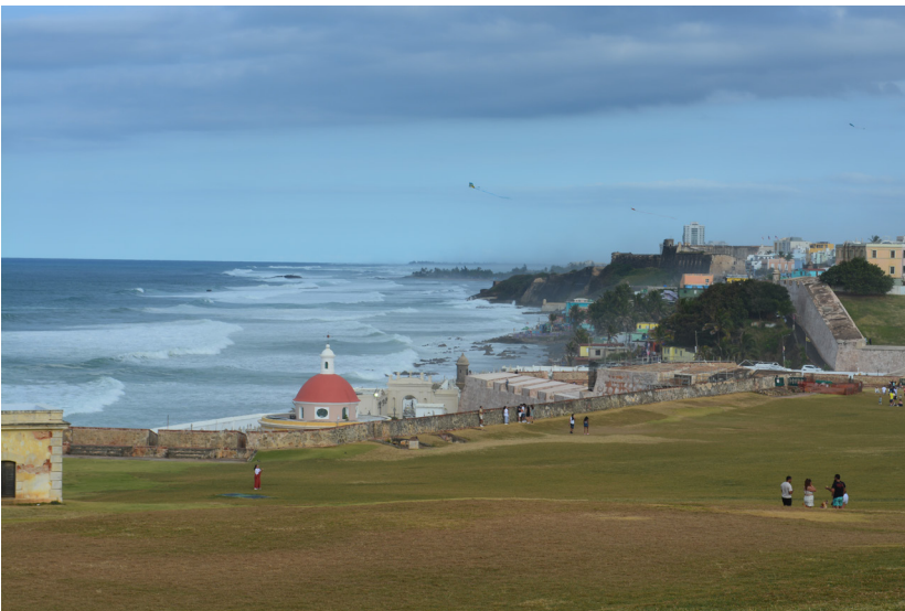
Overlooking Old San Juan Historical District.

The group arrived in Puerto Rico at varied times March 10 and 11 after some flight delays or cancellations. All in all, everyone landed safe and sound, ready to enjoy the warm weather and see what Puerto Rico had to offer. The first full day was spent sight-seeing in the Old San Juan Historical District