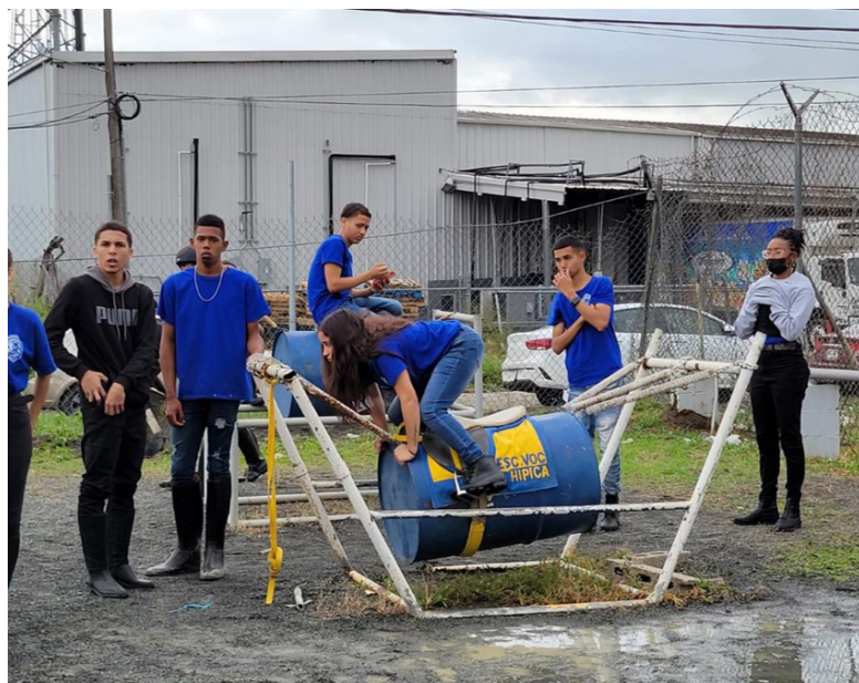
Students practicing their balance and technique at the Vocational Equestrian School of Puerto Rico at Hipódromo Camarero.