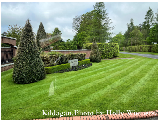
Kildagan.