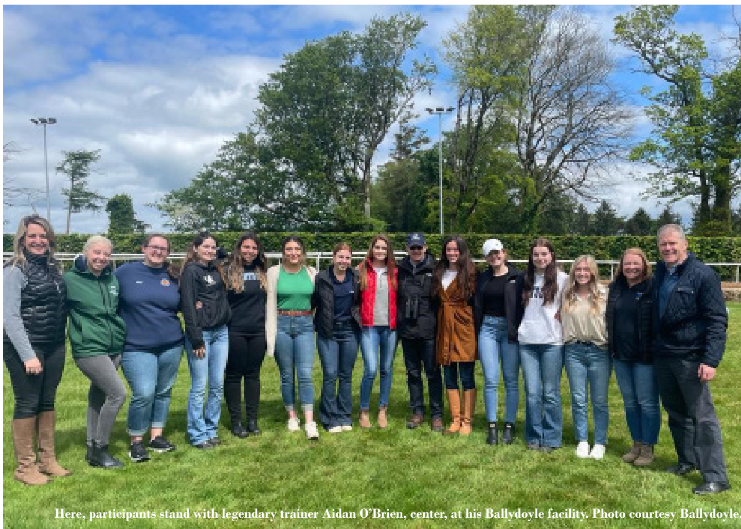
Here, participants stand with legendary trainer Aidan O'Brien, center, at his Ballydoyle facility.

Recently 11 students in the University of Kentucky's Equine Science and Management undergraduate degree program embarked on a once-in-a-lifetime study abroad opportunity to visit and learn from the best of Ireland's equine industry.