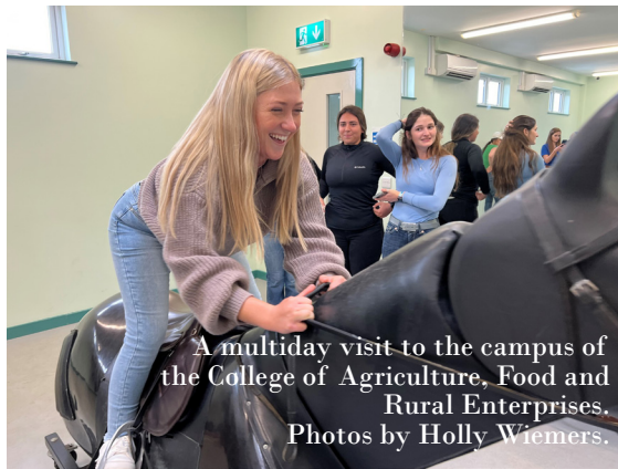
A multiday visit to the campus of the College of Agriculture, Food and Rural Enterprises.