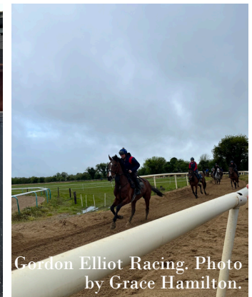
Gordon Elliot Racing.