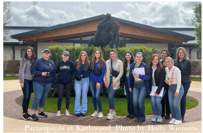
Participants at Karlswood.

Students also toured Kildangan Stud, Godolphin Ireland headquarters, known worldwide for Thoroughbred racehorse breeding. In addition to touring the vast operation, students also learned more about the prestigious and highly competitive Godolphin Flying Start program, a two-year management and leadership training program that immerses trainees in the global industry of Thoroughbred horseracing. The University of Kentucky has had several students in the program since its inception more than two decades ago.