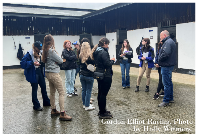
Gordon Elliot Racing.