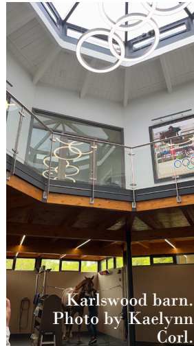
Karlswood barn.