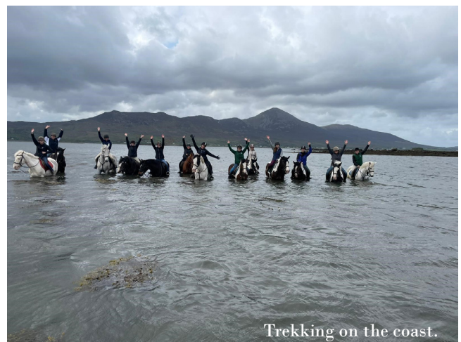
Trekking on the coast.