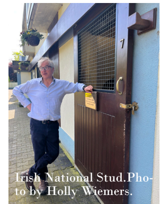
Irish National Stud.