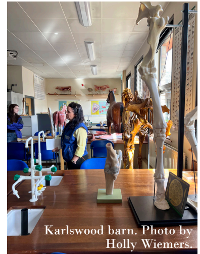
Karlswood barn.