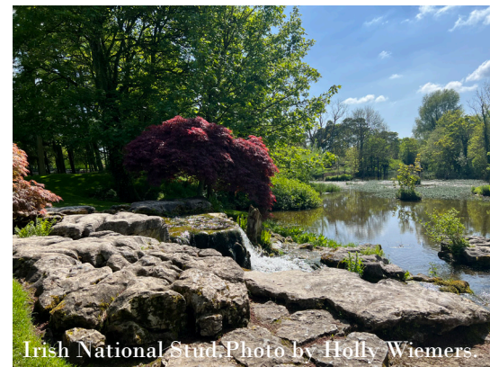
Irish National Stud.