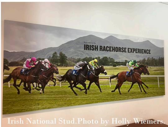
Irish National Stud.