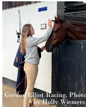
Gordon Elliot Racing.